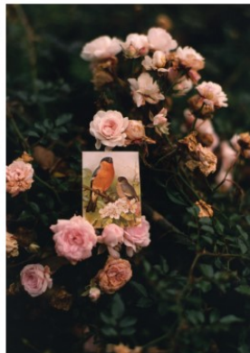
Birds 025 (2012)