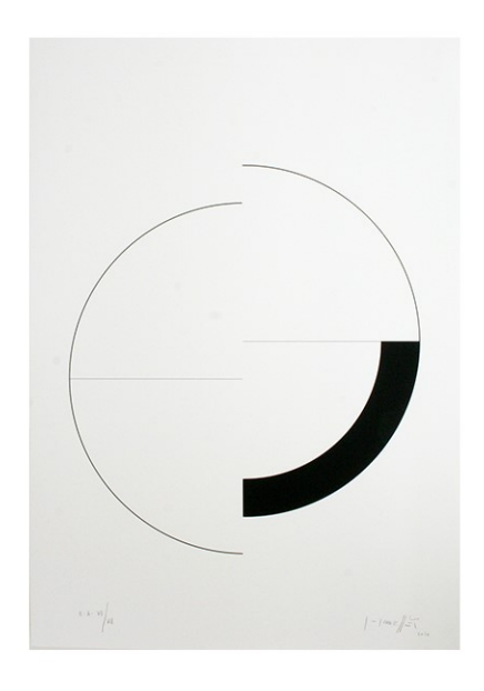
GOTTFRIED HONEGGER Kreis 2, 2010