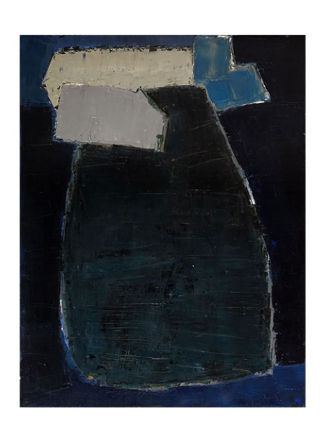
NICOLAS DE STAËL Grande composition blueue, 1950