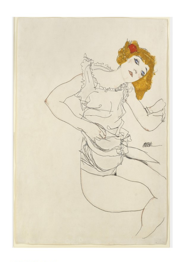
EGON SCHIELE Blond Girl in Underwear, 1913