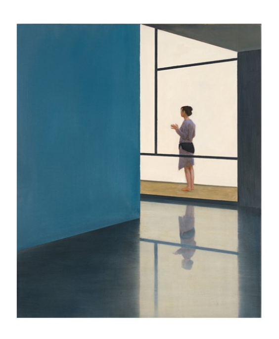
TIM EITEL 1925/2016