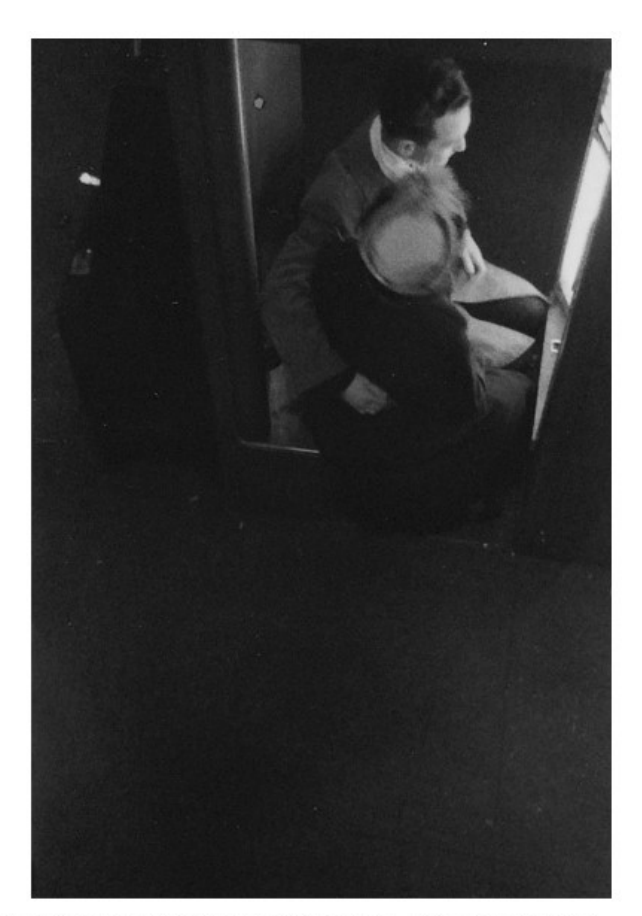
Left: F&C Walter Galerie, Herb Ritts – Headless Nude Silverlane, 1985 / Right: F&C Walter Galerie, Saul Leiter – At the Photo Booth, 1940s